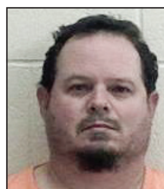
Timothy Alan Gunn